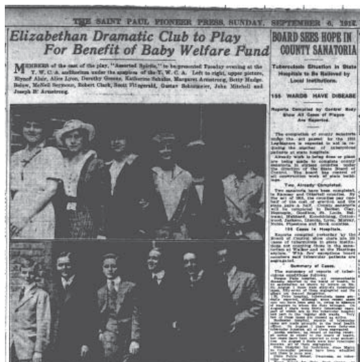
Saint Paul Pioneer-Press, Sept 8, 1914